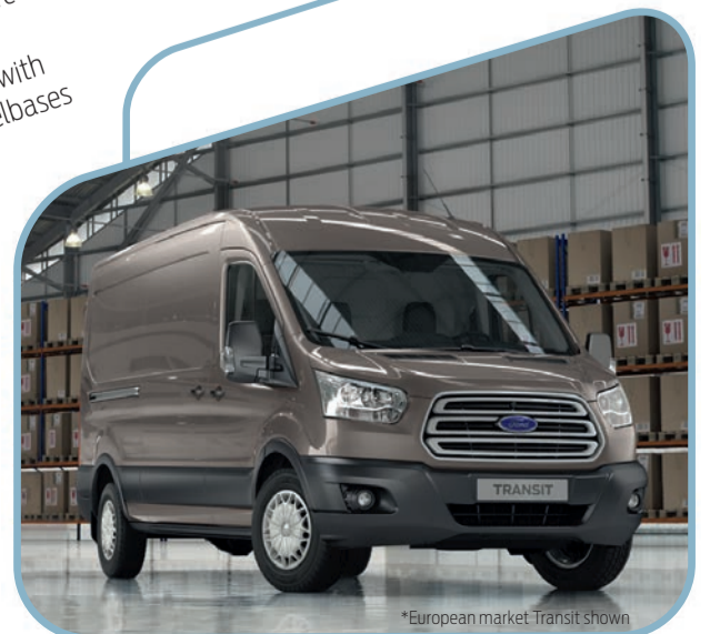
*European market. Transit shown