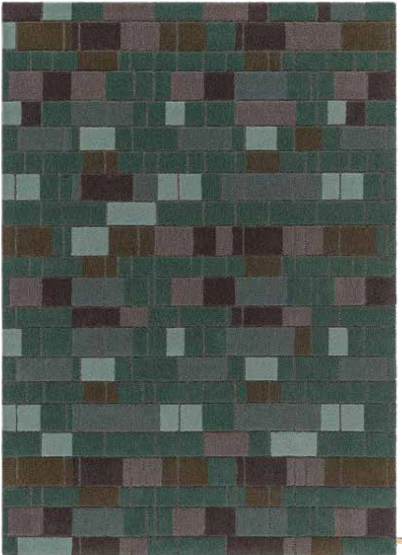
Rug 170x240 cm, Green 300