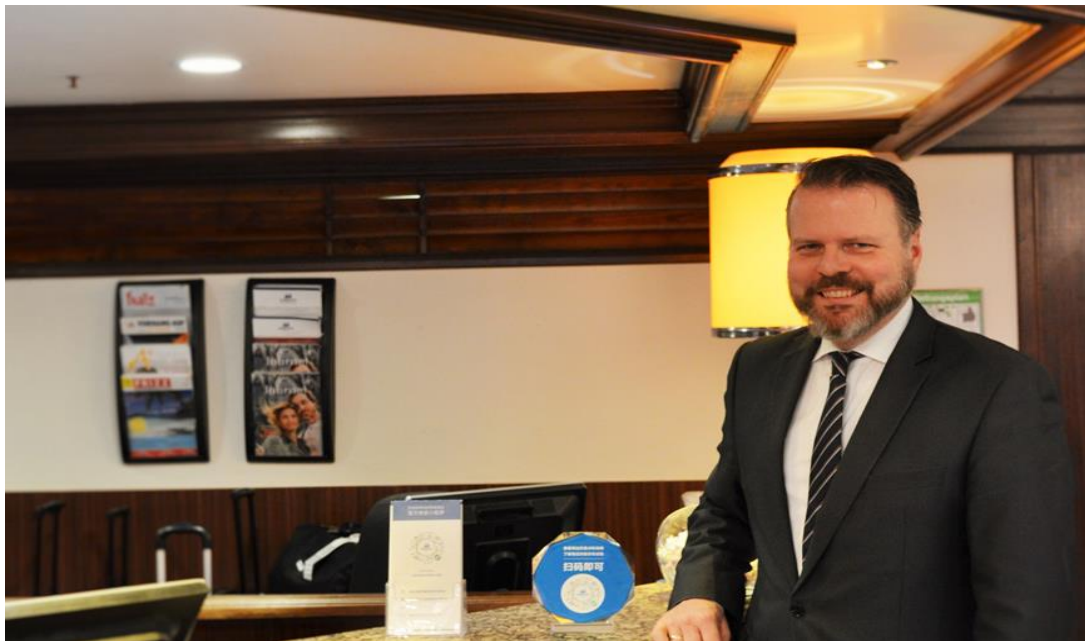
( 小程序二维码前台展示照片 )

( WeChat Mini-Program Image displayed in guest rooms )