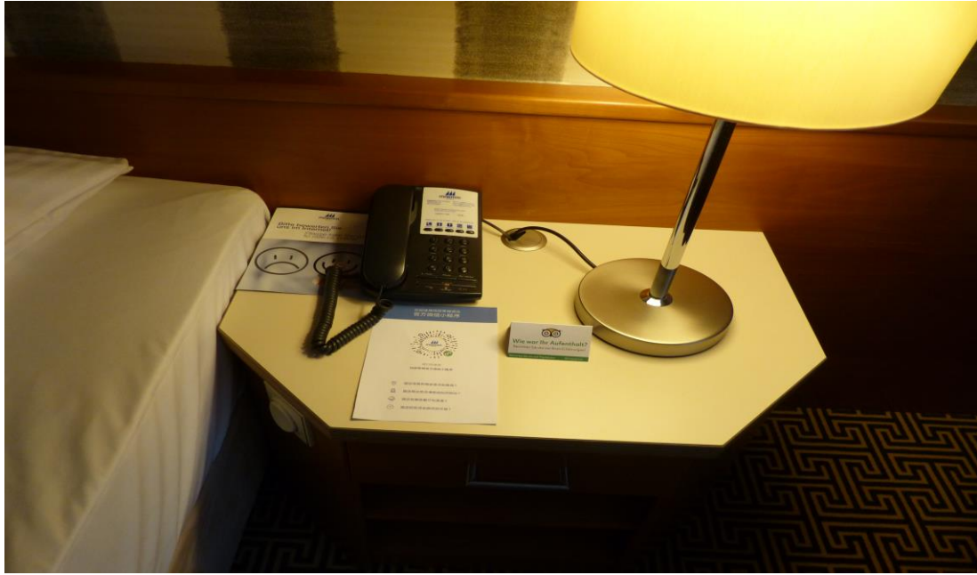
( 小程序二维码房间展示照片 )

( WeChat Mini-Program Image displayed in guest rooms )